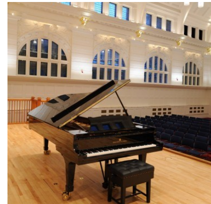
Art and Culture